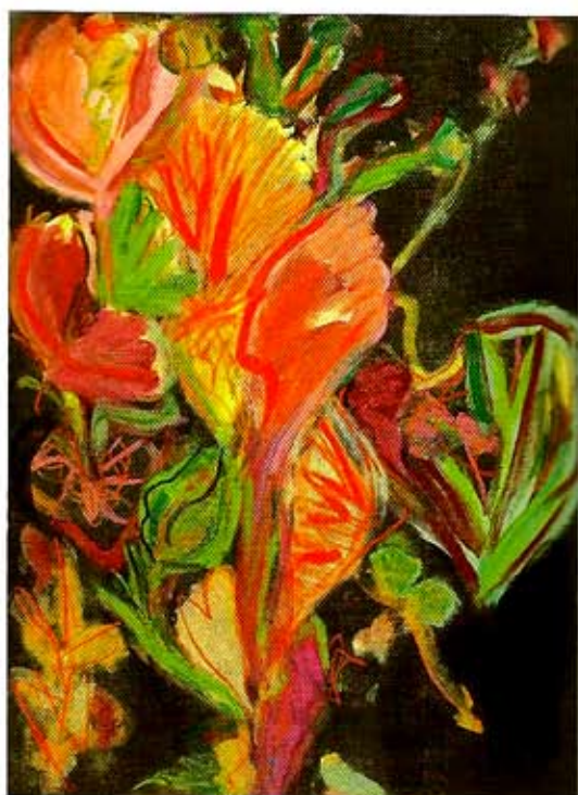
Rowann Villency, La Nuit en fleur 1 , 2011, acrylic and mixed media on paper, 30" x 22". Walter Wickiser.

With its loosely painted, pastel-colored blossoms on a white ground, Le Fleur en folie 1 was one of several large mixed-media pieces on paper, as airy as spring breezes and equally refreshing. The ravishing streaks of yellow, plum, chartreuse, and magenta offered a seductive escape from daily life. "Les Fleurs," a series of three works done with stencils and spray paint to create misty, layered effects, was part of a larger group that betrayed Japanese influences and revealed Vil-