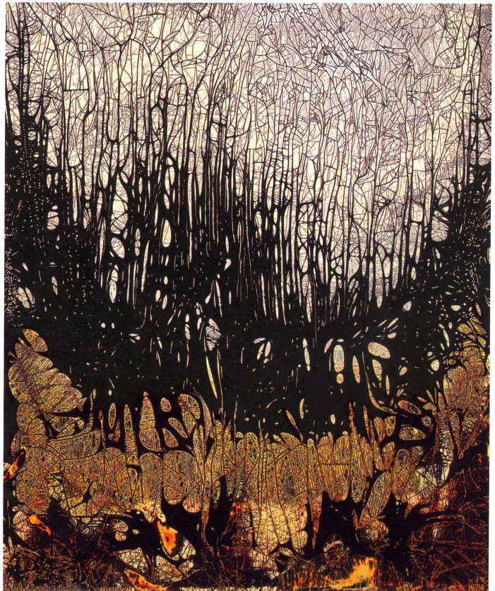
Nolan Preece, Woodland, 2014, chemigram, 20" x 16", edition of 10

Walter Wickiser's Currents in Photography presents a luminous array of prints that are at times spiritual and ethereal. The transcendental vision of these photographers blends and blurs the painterly and the photographic in an indelible exhibition.