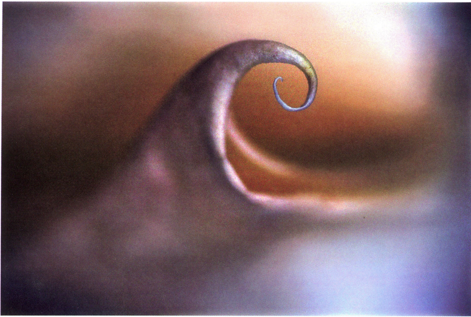
Bert GF Shankman, Hokusai, 2000, pigment print, 20" x 20"

distinctly unearthly, seductive and phantasmagorical.